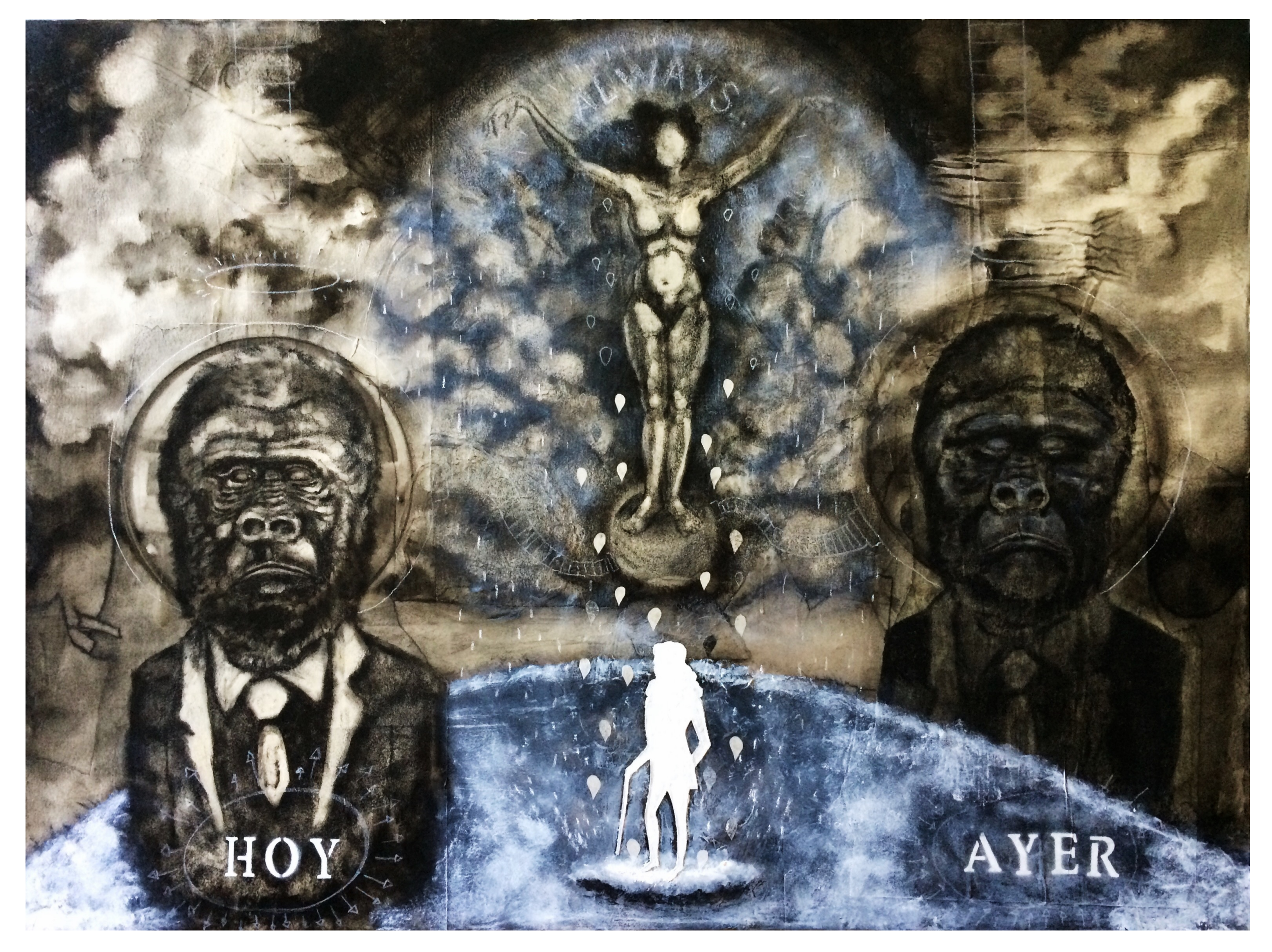
Title: Hoy is Always Ayer. Medium: Monotype, cut canvas, and oil on canvas. Dimensions: 48" x 36". Year: 2017