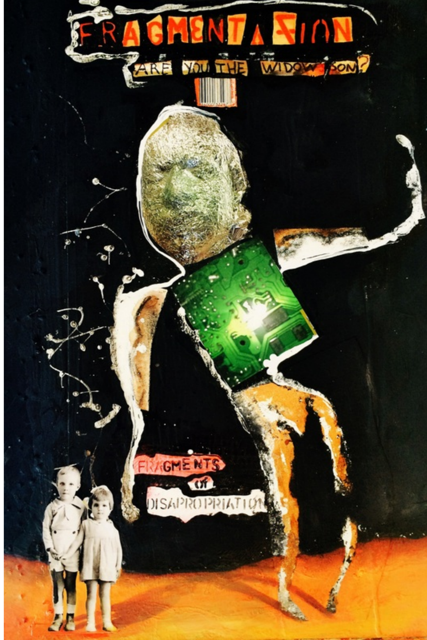
Creature #4, 2014 Mixed Media on Wood Panel, 16" x 24"