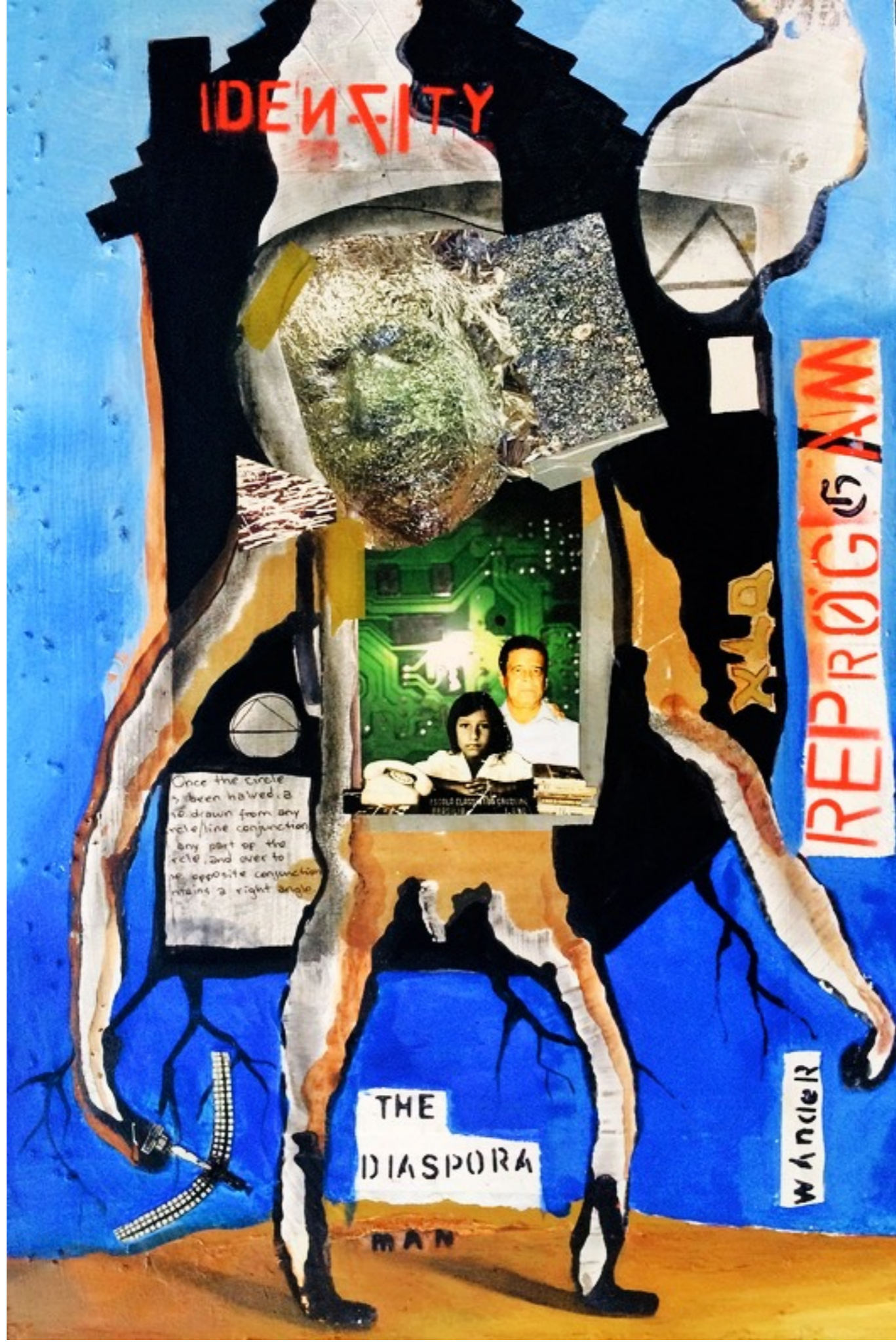
Creature #17, 2014 Mixed Media on Wood Panel, 16" x 24"