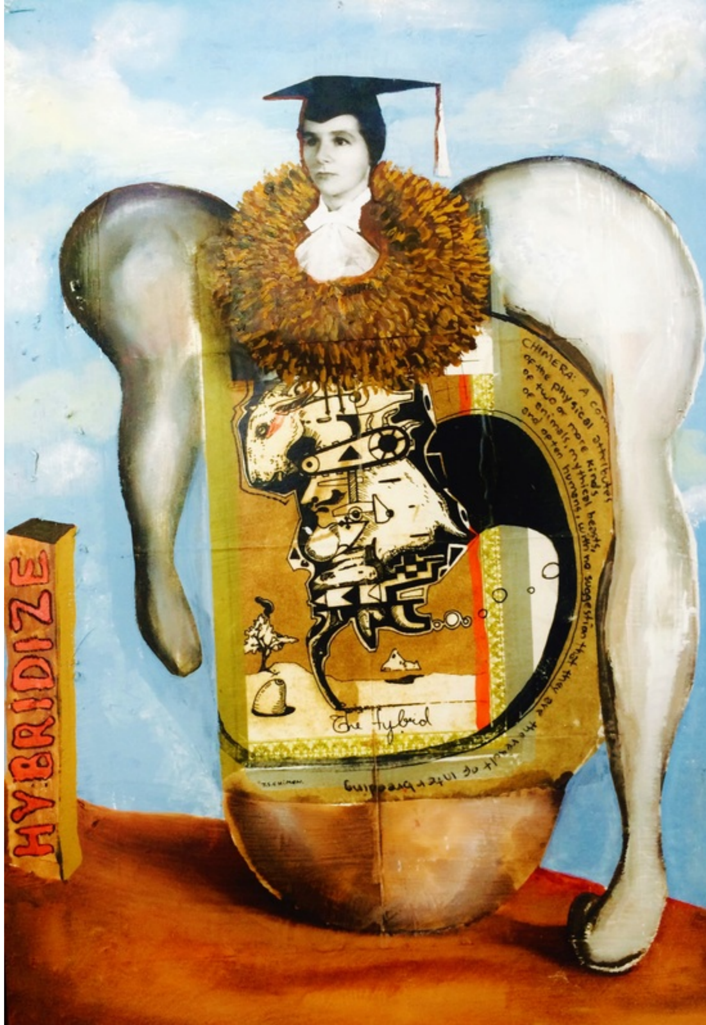
Creature #2, 2014 Mixed Media on Wood Panel, 16" x 24"