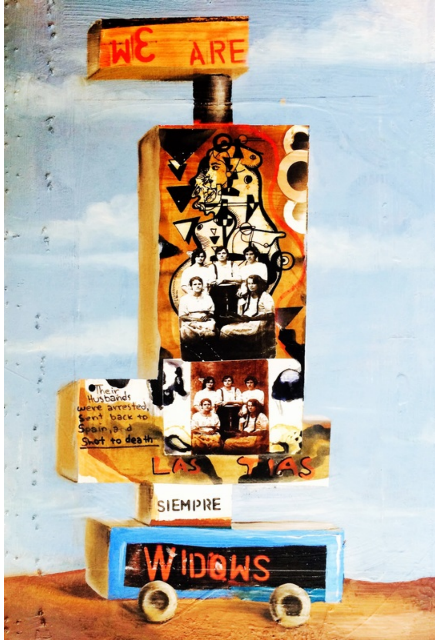
Creature #20, 2014 Mixed Media on Wood Panel, 16" x 24"