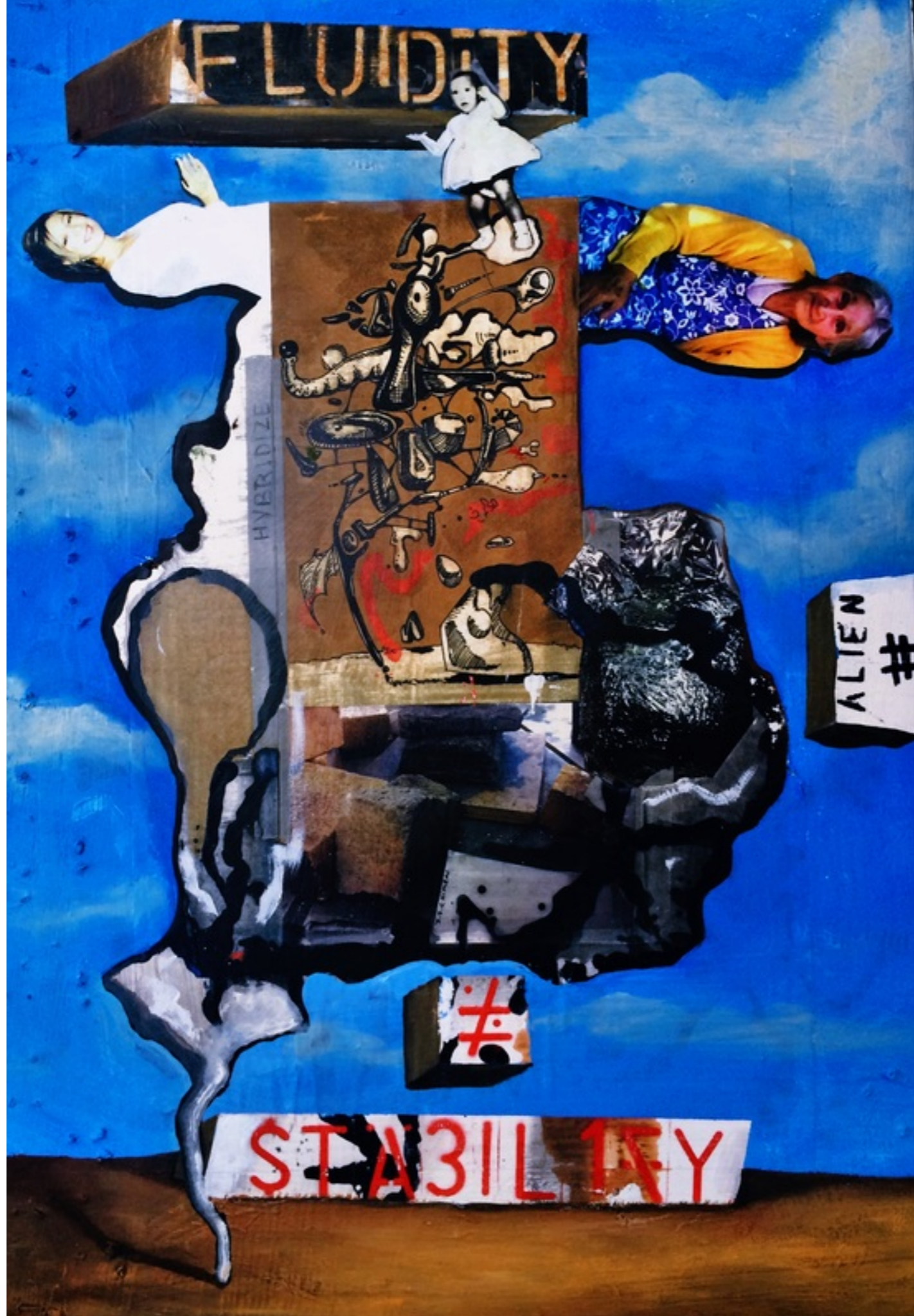
Creature #19, 2014 Mixed Media on Wood Panel, 16" x 24"