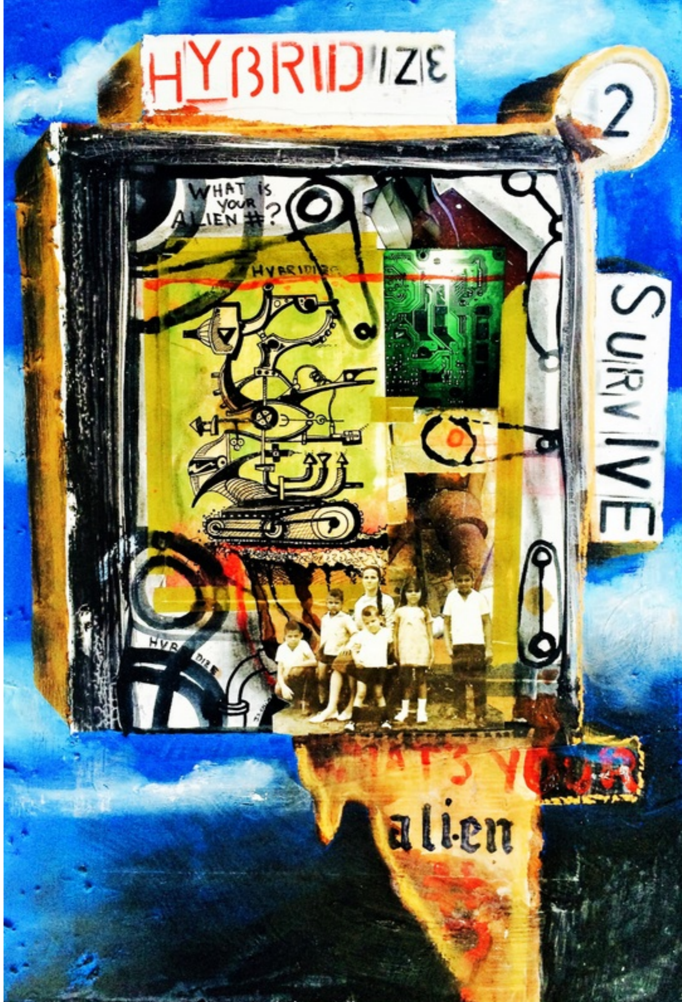
Creature #10, 2014 Mixed Media on Wood Panel, 16" x 24"