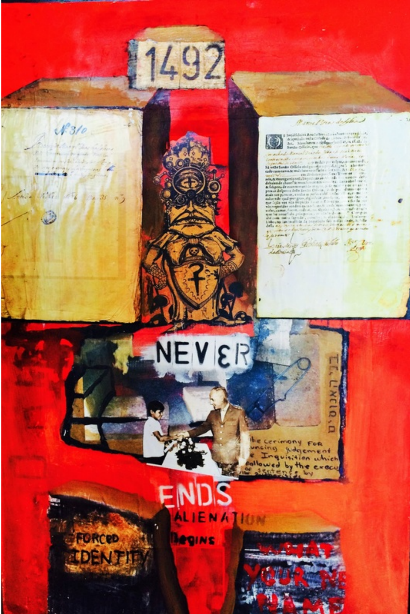
Creature #18, 2014 Mixed Media on Wood Panel, 16" x 24"