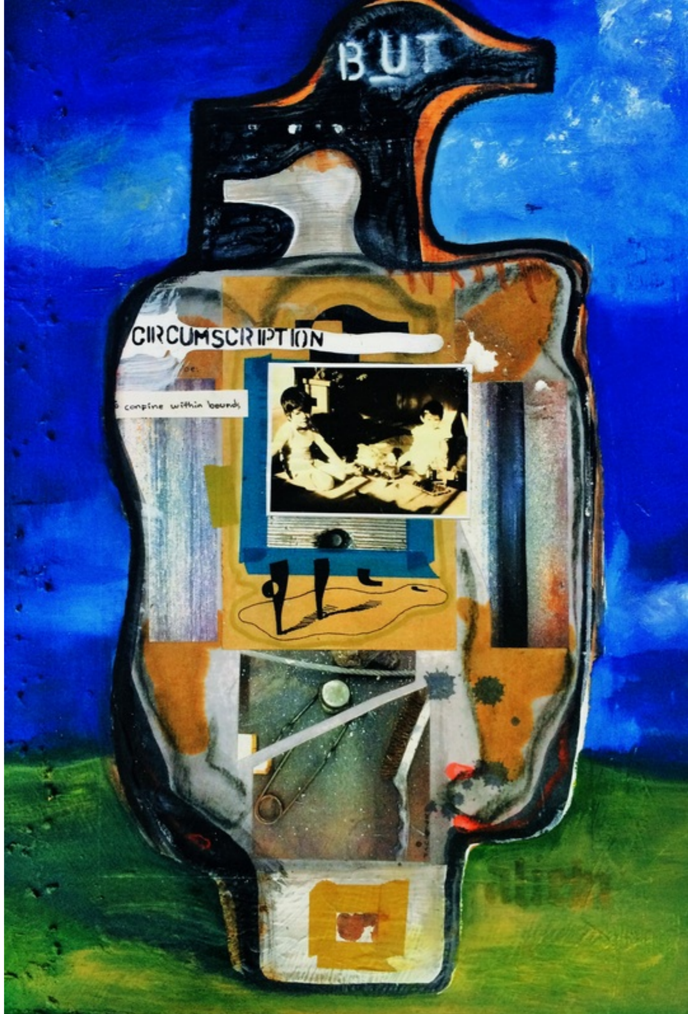
Creature #9, 2014 Mixed Media on Wood Panel, 16" x 24"