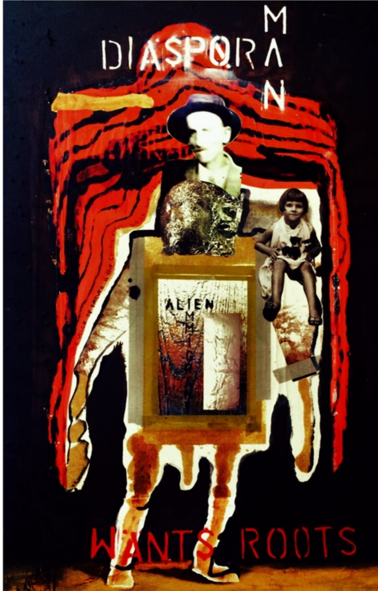
Creature #11, 2014 Mixed Media on Wood Panel, 16" x 24"