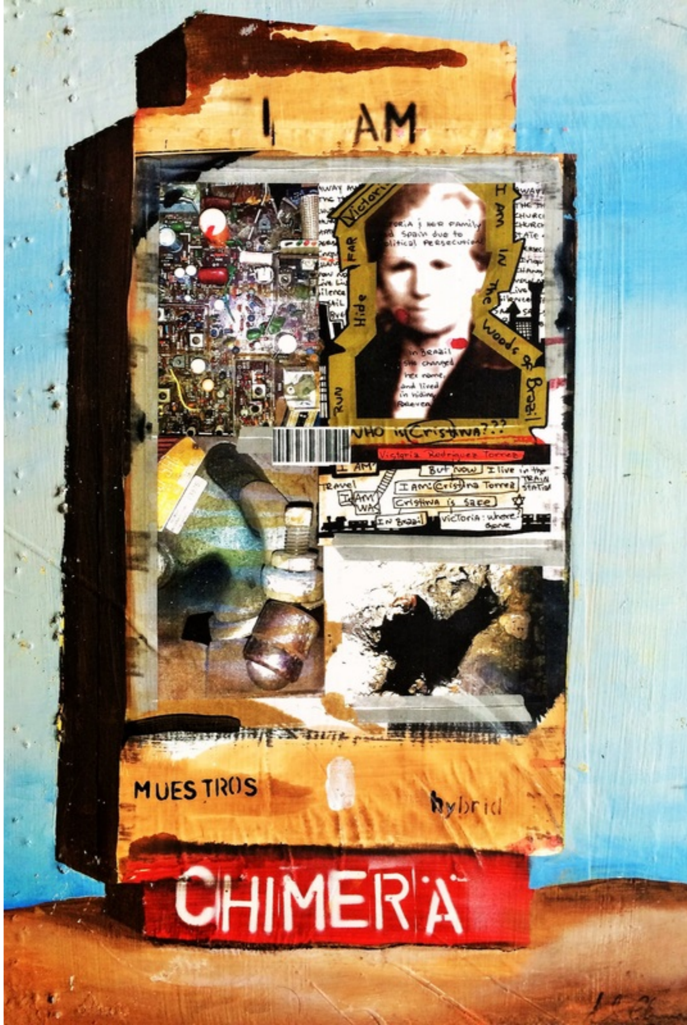
Creature #3, 2014 Mixed Media on Wood Panel, 16" x 24"