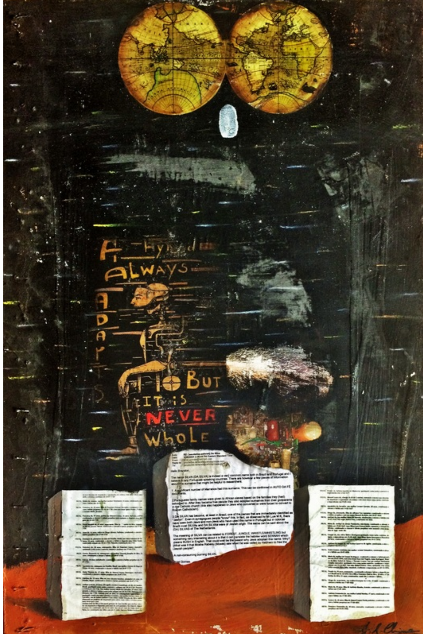
Creature #15, 2014 Mixed Media on Wood Panel, 16" x 24"