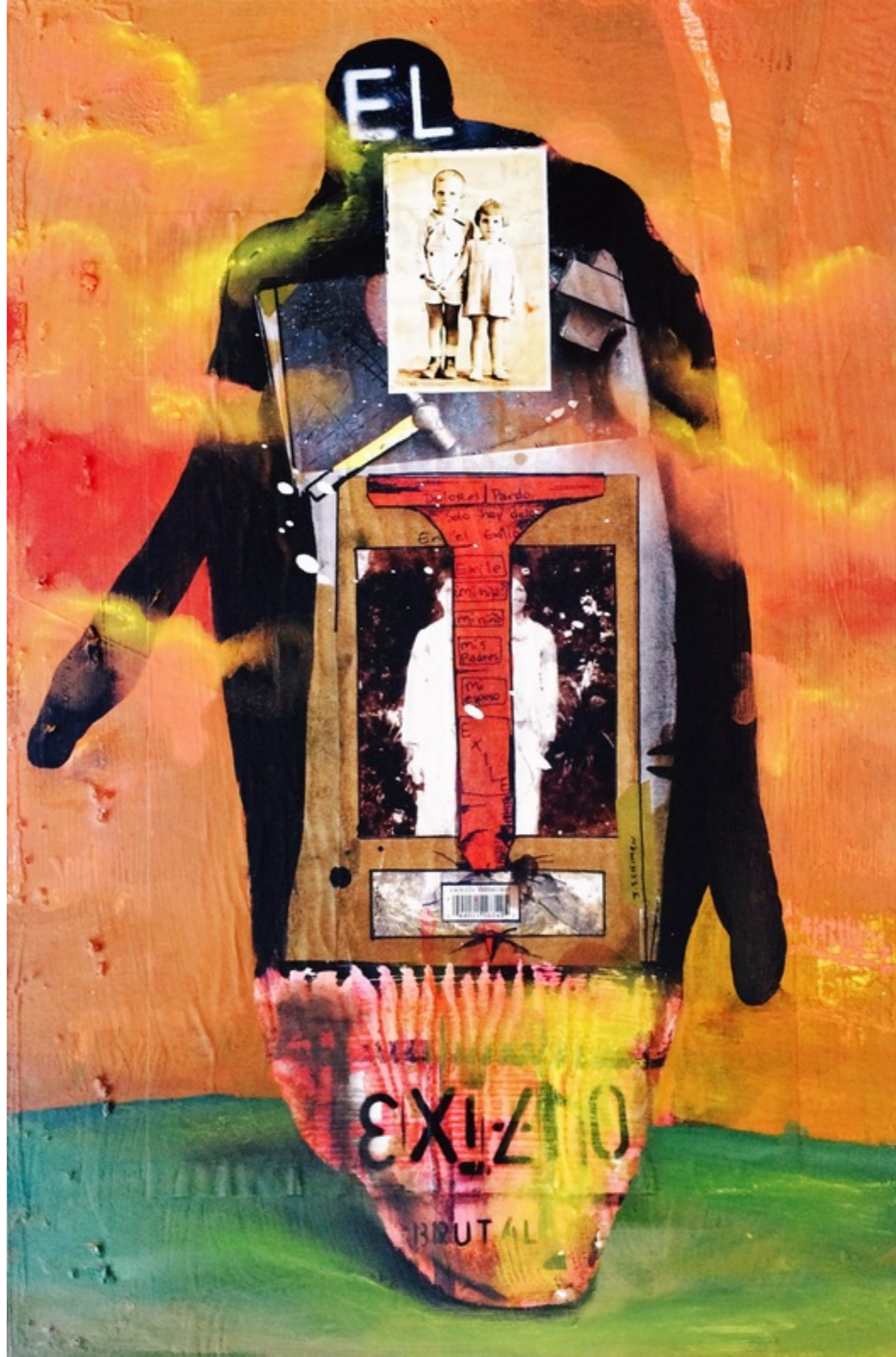
Creature #14, 2014 Mixed Media on Wood Panel, 16" x 24"