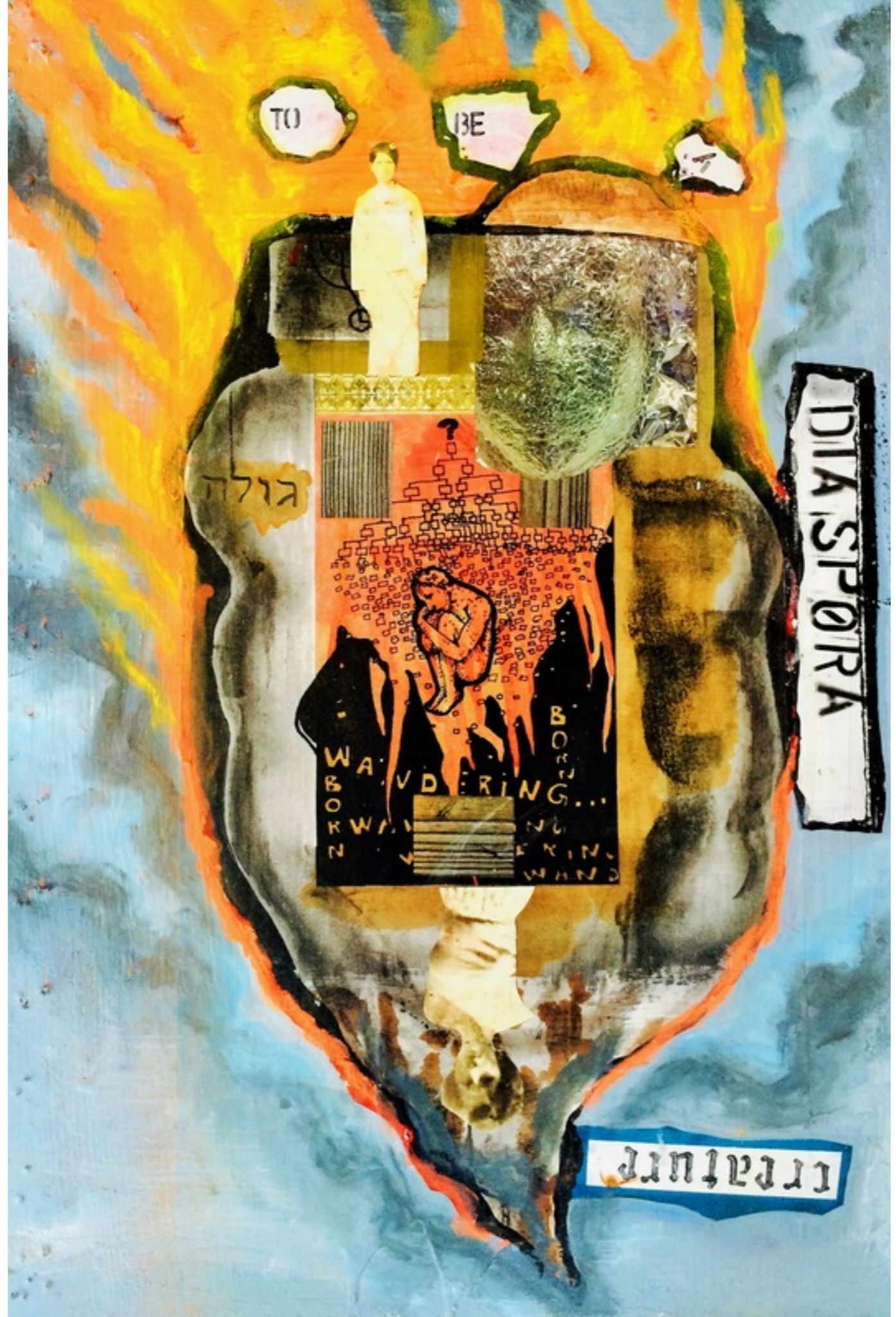
Creature #5, 2014 Mixed Media on Wood Panel, 16" x 24"