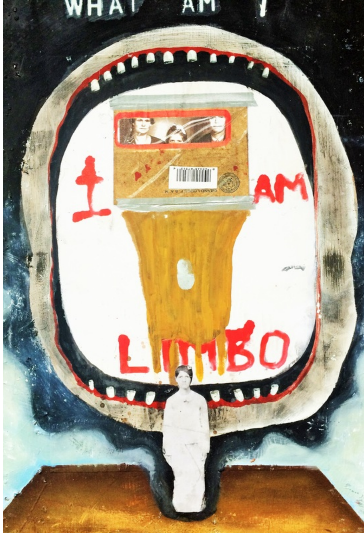
Creature #13, 2014 Mixed Media on Wood Panel, 16" x 24"