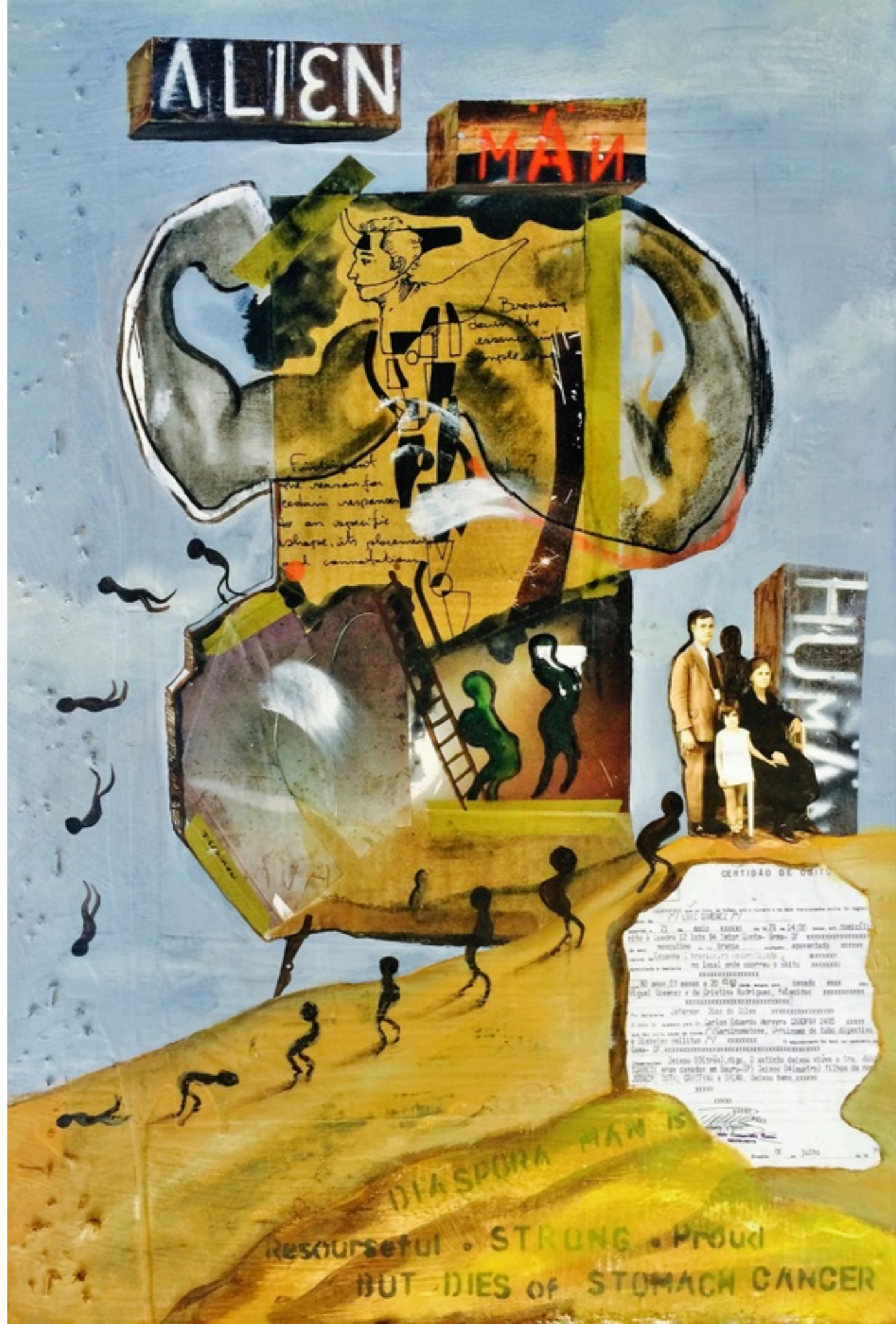
Creature #7, 2014 Mixed Media on Wood Panel, 16" x 24"