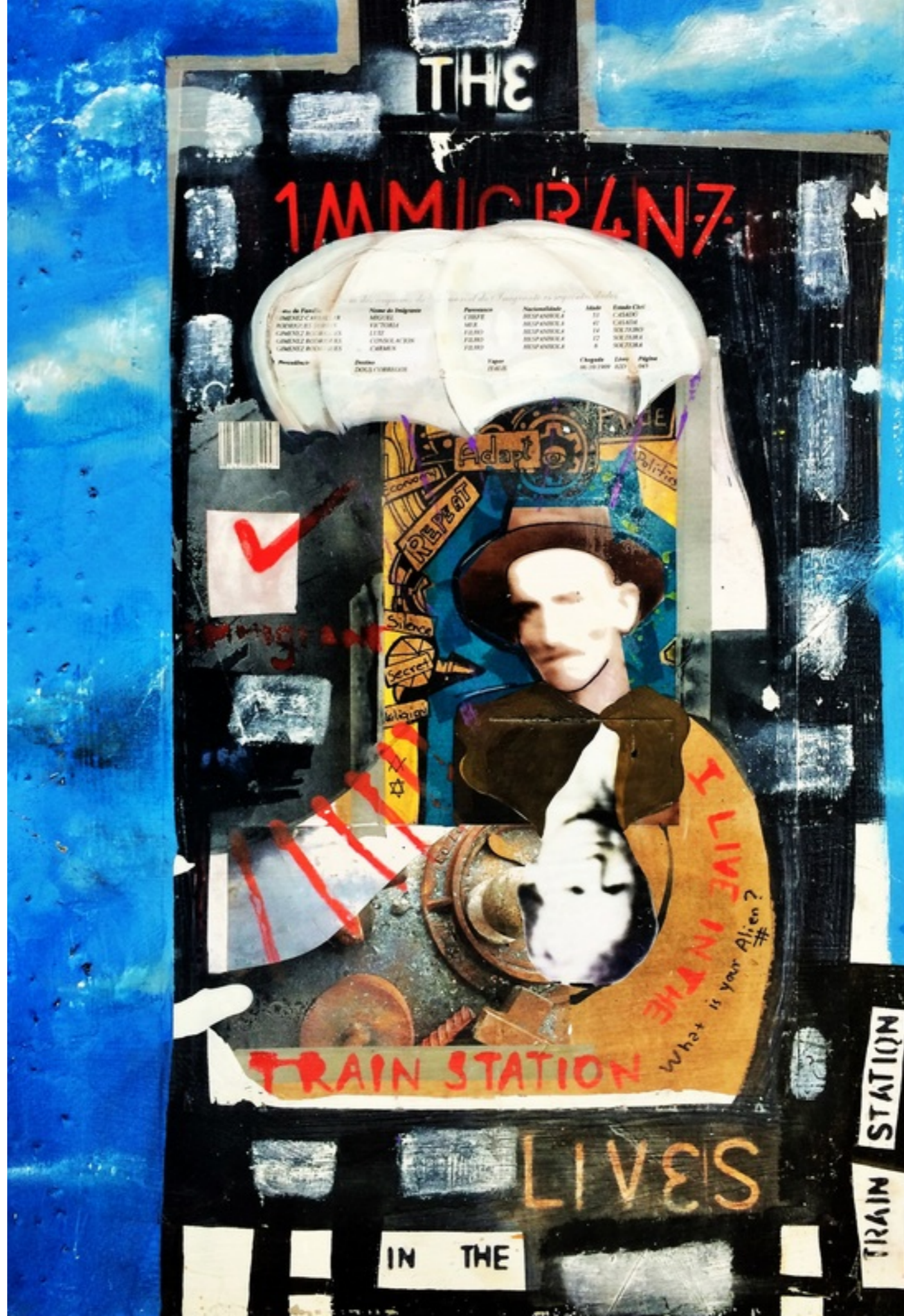
Creature #12 , 2014 Mixed Media on Wood Panel, 16" x 24"