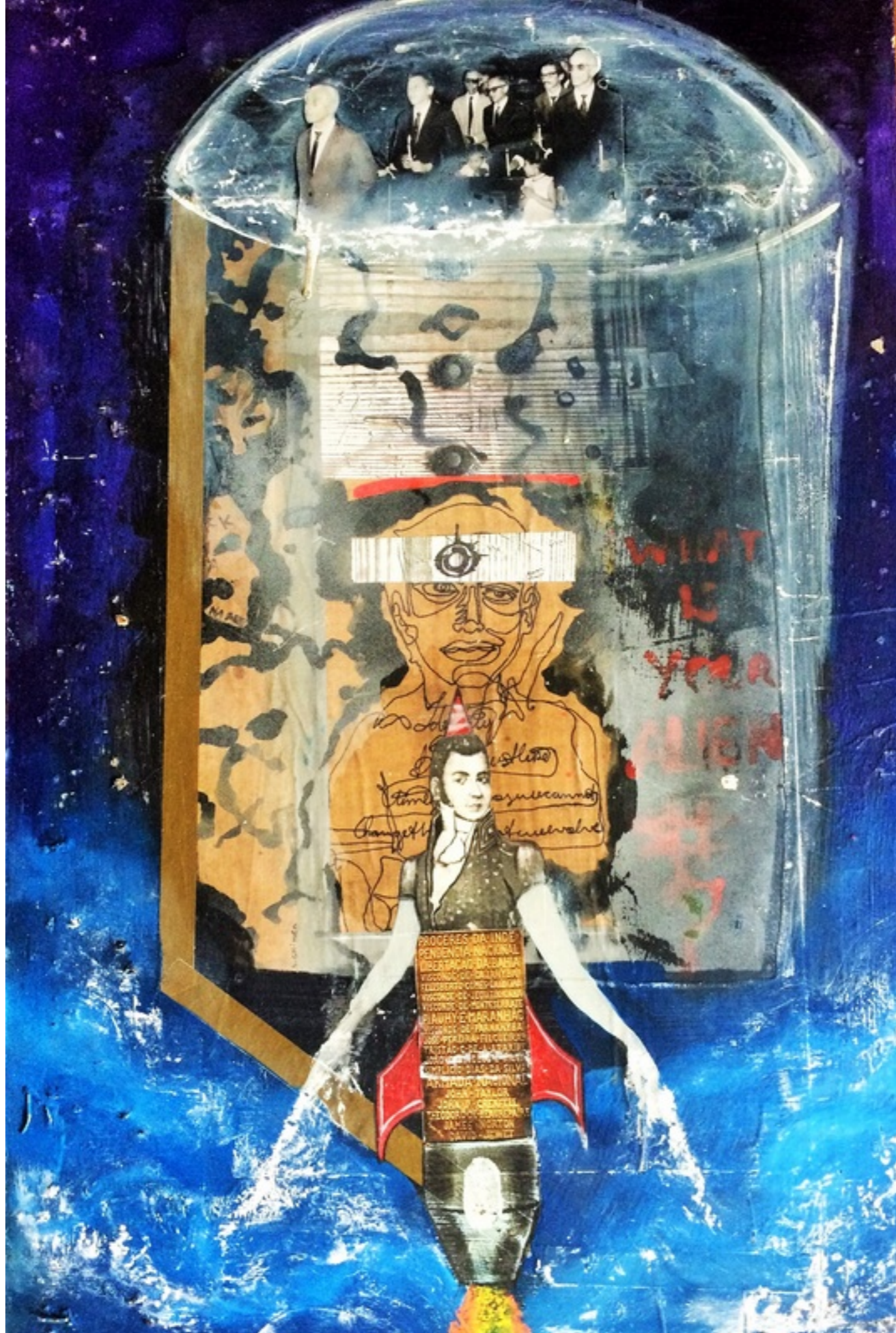
Creature #8, 2014 Mixed Media on Wood Panel, 16" x 24"